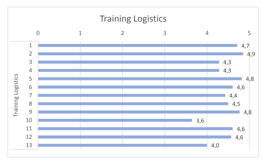
Chart 1. 1 Evaluation statements related to training logistics

The highest level of satisfaction regards the organizations for flights and buses/transfers (4,9), working conditions for the training and location (4,8) and the availability of tutors for additional information and assistance (4,8).