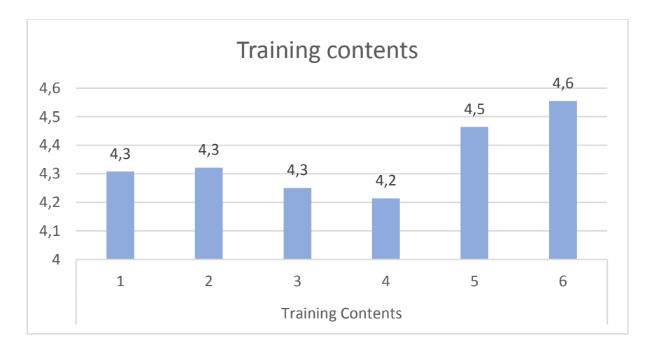
Chart 1. 2 Evaluation statements related to training contents

No statements received less than 4/5 grades showing a high satisfaction rate. Sharing of good practices session (4,6) and the innovative methods and tools for social inclusion offered during the training (4,5) were evaluated as excellent. 4,2 for the practical activities may reveal a kind of interest for more practical approach during the training.