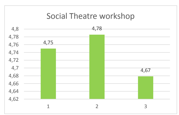
Chart 3 .5 Social Theatre workshop rate in evaluation questionnaire

Even though we do not have accurate data about these workshops, answers which were not related to a specific workshop, give us all values above 4/5. Therefore, we can suppose the average of both items would have been the same or even higher.